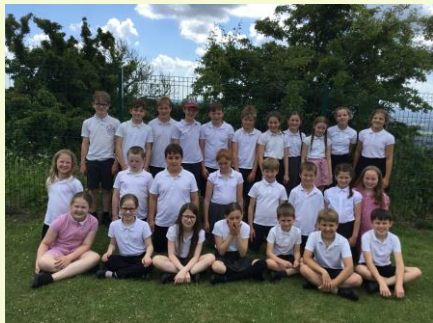
Swimming Gala Team