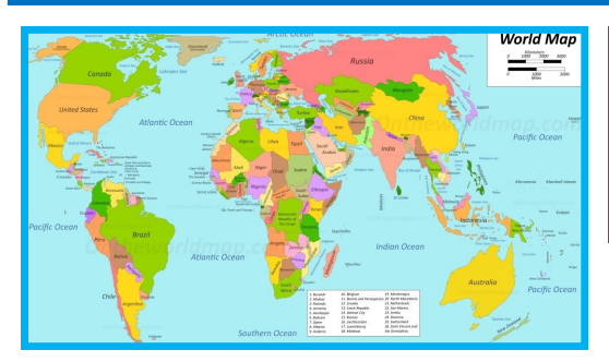
How does climate affect vegetation?