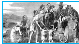
Irish migrants due to famine

What different migrant groups have come to Britain over time?