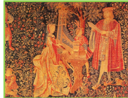
Job opportunities: Flemish weavers

What has pulled different groups to Britain?