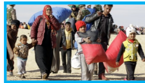
Syrian refugees due to war

What has pulled different groups to Britain?