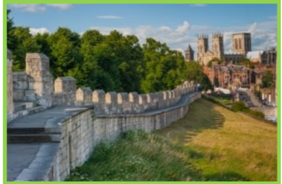
York City Walls