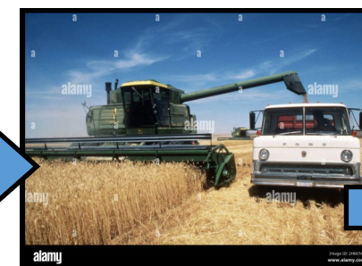
Harvesting in the 1980s