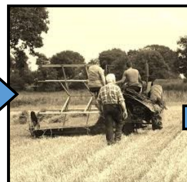
Harvesting in the 1950s