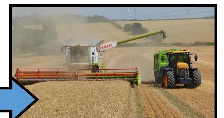
Harvesting in 2020

How have inventions and discoveries helped with farming?