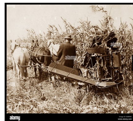
Harvesting in the 1900s