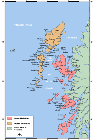
Western Isles of Scotland