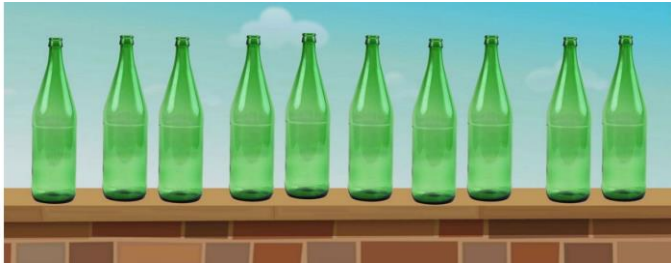
Ten green bottles - BBC Teach

Nursery Rhymes and Songs - A to Z - BBC Teach