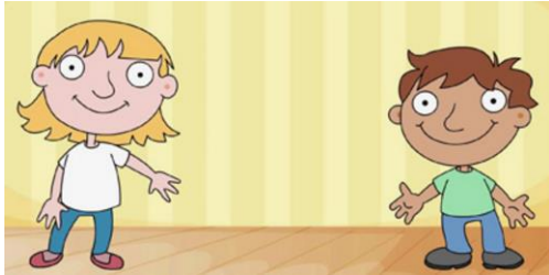
If you're happy and you know it - BBC Teach