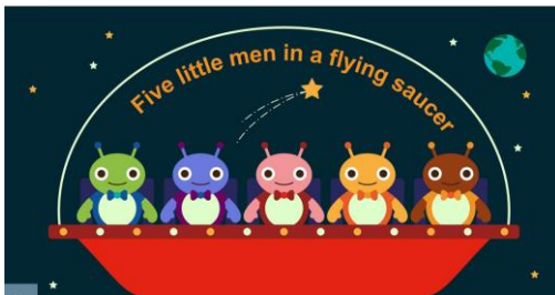
Five little men in a flying saucer - BBC Teach