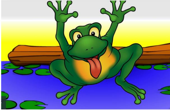
Five little speckled frogs - BBC Teach