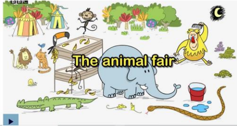
The animal fair - BBC Teach