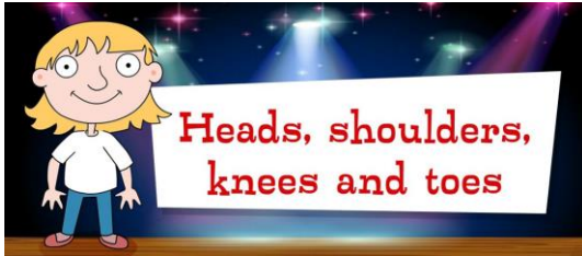
Heads, shoulders, knees and toes - BBC Teach